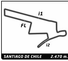
ABB FIA Formula E Championship Round 4 - Santiago ePrix Race